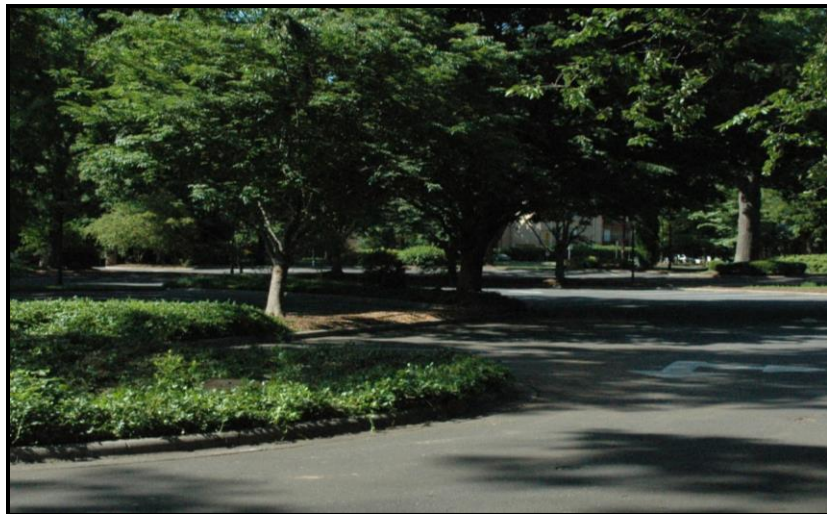
Figure 12.11-2: Example of parking lot broken up by landscaping.

12.11-2 Limitation on Uninterrupted Areas of Parking. Uninterrupted areas of parking lot shall be limited in size. Large parking lots shall be broken by buildings and/or landscape features. See Figure 12.11-2 below: